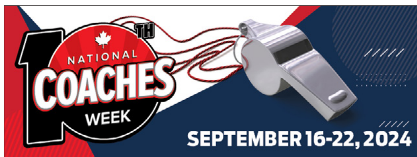
>> Social Media Cover (Size: 851x315)