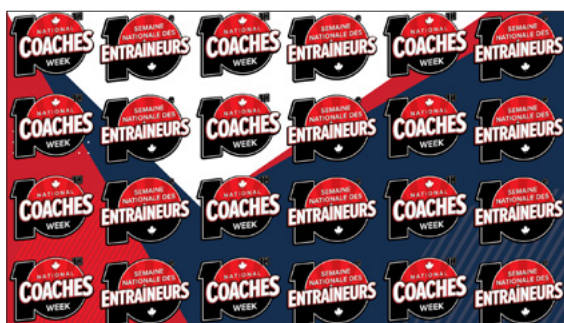
>> Zoom backdrop (1920x1080)