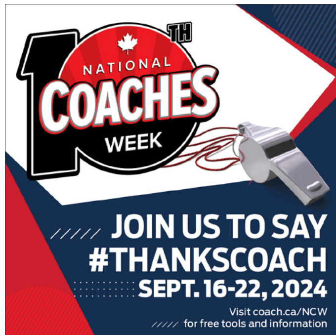
>> Instagram (Size: 1080x1080)