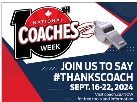
>> Facebook (Size: 1200x900)