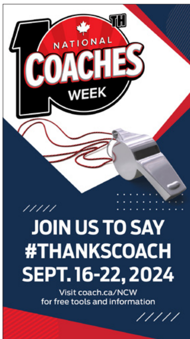
>> Tiktok (Size: 1080x1920)

Graphics help you promote National Coaches Week on your website, on social media, and on any other digital or print materials you may create. We have created the following graphic tools that will help you add a generic National Coaches Week graphic element to your promotions.