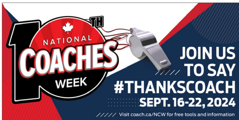
>> Twitter (Size: 1200x600)