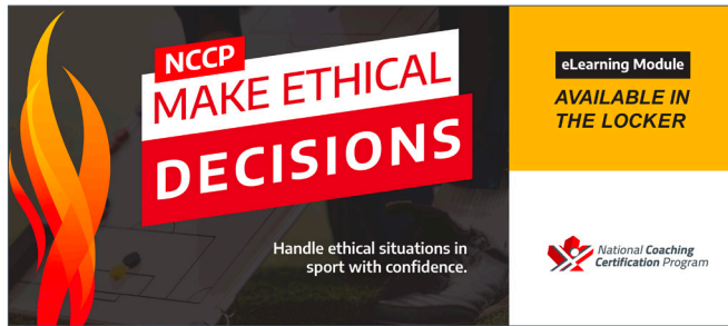
Graphic 5: Facebook Banner