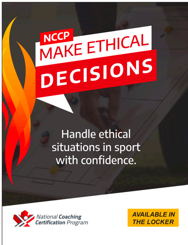
Graphic 7: Facebook/Instagram/LinkedIn Graphic