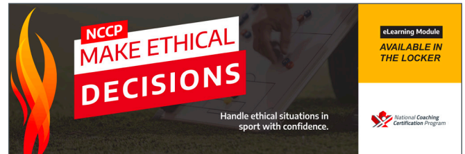
Graphic 6: X Banner